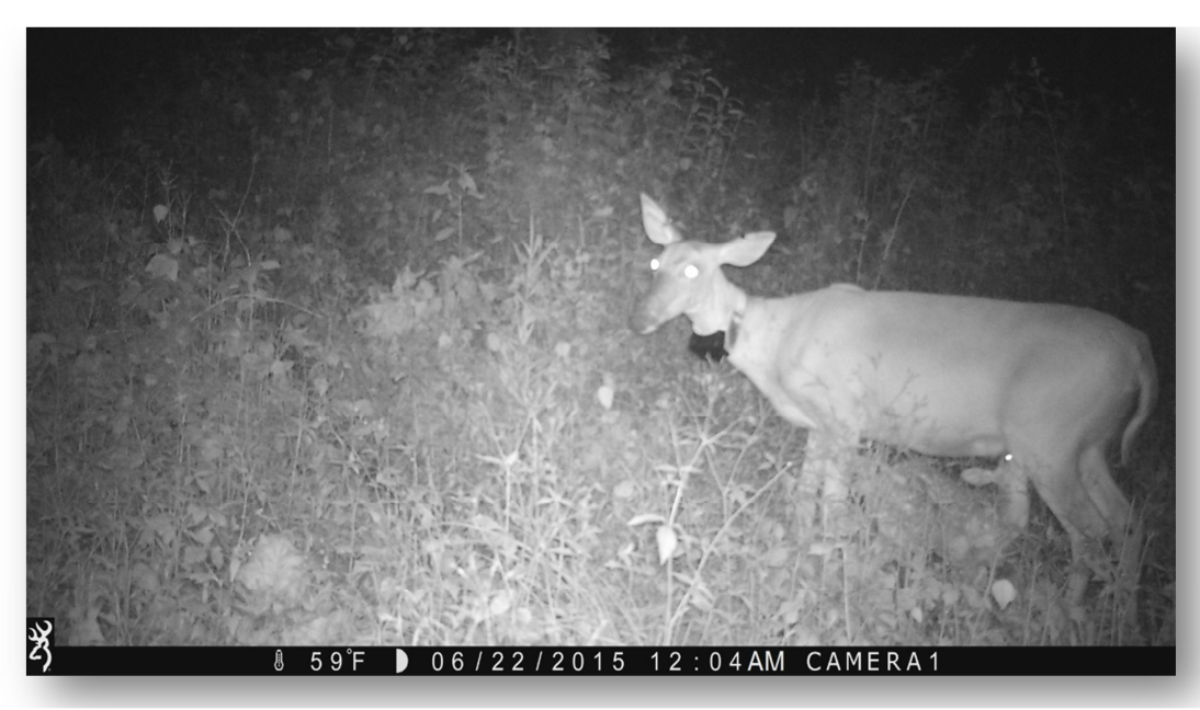
This Wisconsin doe with a fawn was radio-collared at the beginning of the CWD eradication program and probably now is at least 12 years old. According to the landowner, she is not the only collared deer in the CWD area.

The photograph below is one of those obtained by the landowner of a collared doe with a fawn that must be about 12 years of age, given the time since she was captured. The fact she is not only healthy but also a fawn provides impeachment to those who think deer will go extinct from CWD. In the future, I am recommending resurrecting the study to determine life expectancies from these deer.