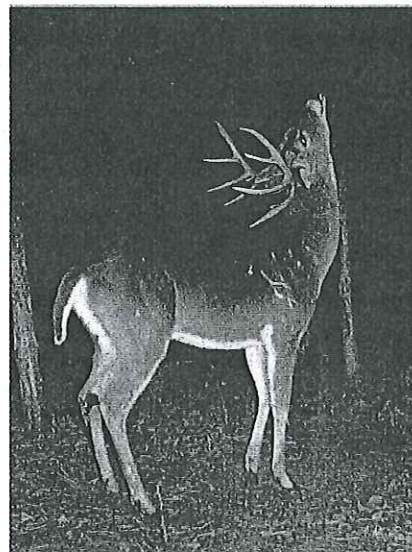
Careful study of photos taken with scouting cameras can reveal a lot about hunting and managing the deer in your area.

Another problem with Google Earth images is they aren’t “spatial” — that is, a photo can’t be used for exact locations of features. (The importance of this will become obvious later in our discussion.) If you want imagery